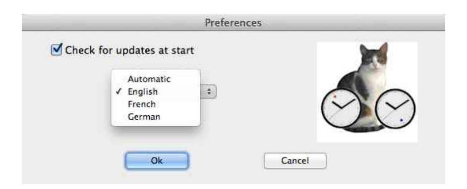
Figure 3: The preferences dialog

Note that by using the menu GizmoDateCalculator → Preferences you access the Preferences dialog (see figure [3]) which allows you to choose the language of the interface: